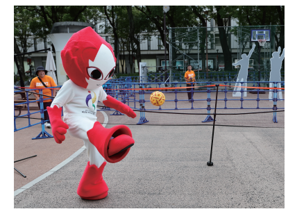
Sepak Takrow demonstrated by the official mascot, "Honohon"