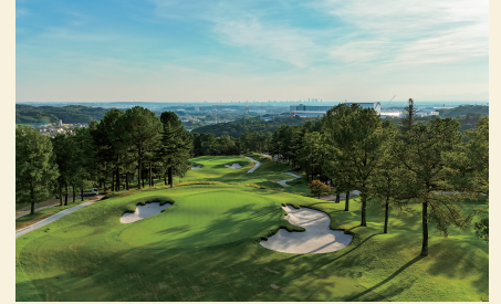
Kasugai Country Club East Course

Check the official social media for information on the Games!